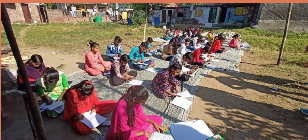
Exam of the students were taken by the teacher by visiting to the community