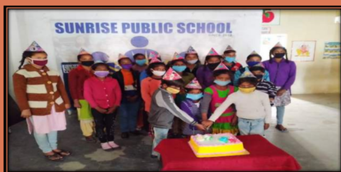
Birthday celebration of students study in Sunrise Public School

We had also distributed refreshment to the children of Sunrise Public School in which we gave them eatable things.