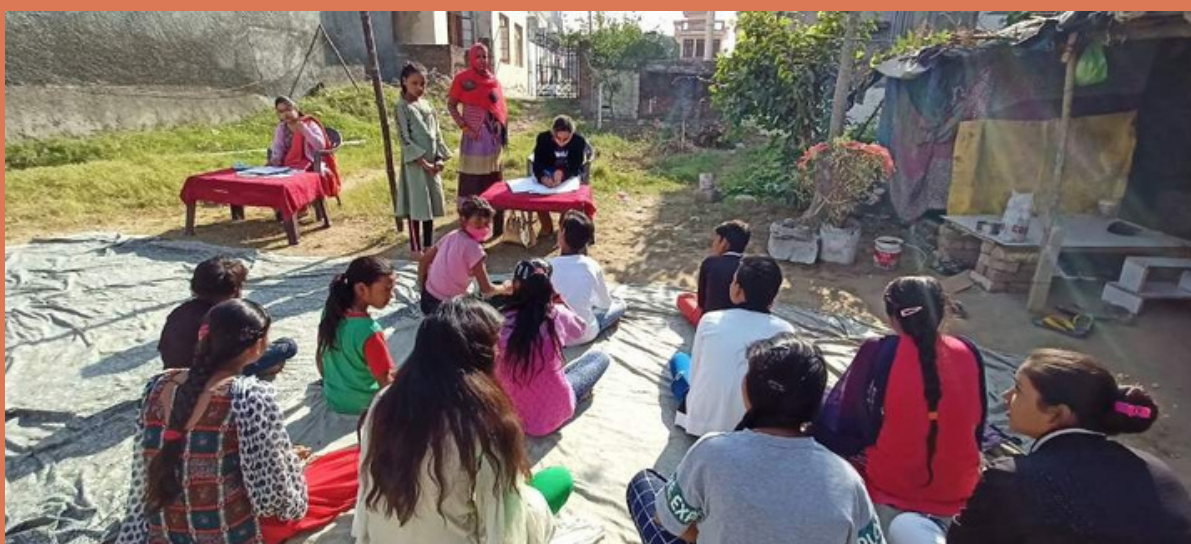
Result of exam given to the students by visiting in the community.