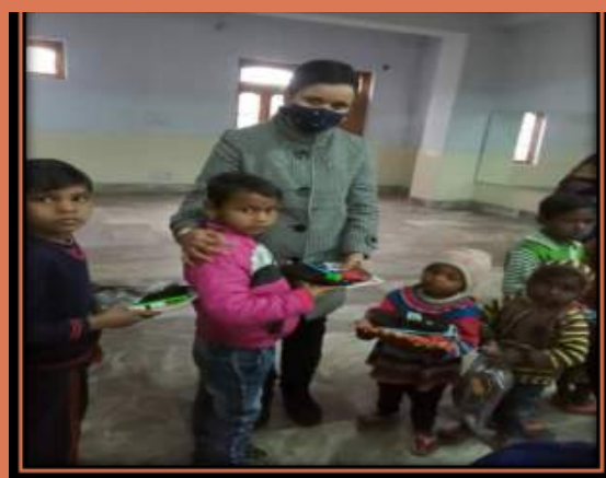
Sunrise Public School distributed warm clothes to needy children of talab tillo jammu.