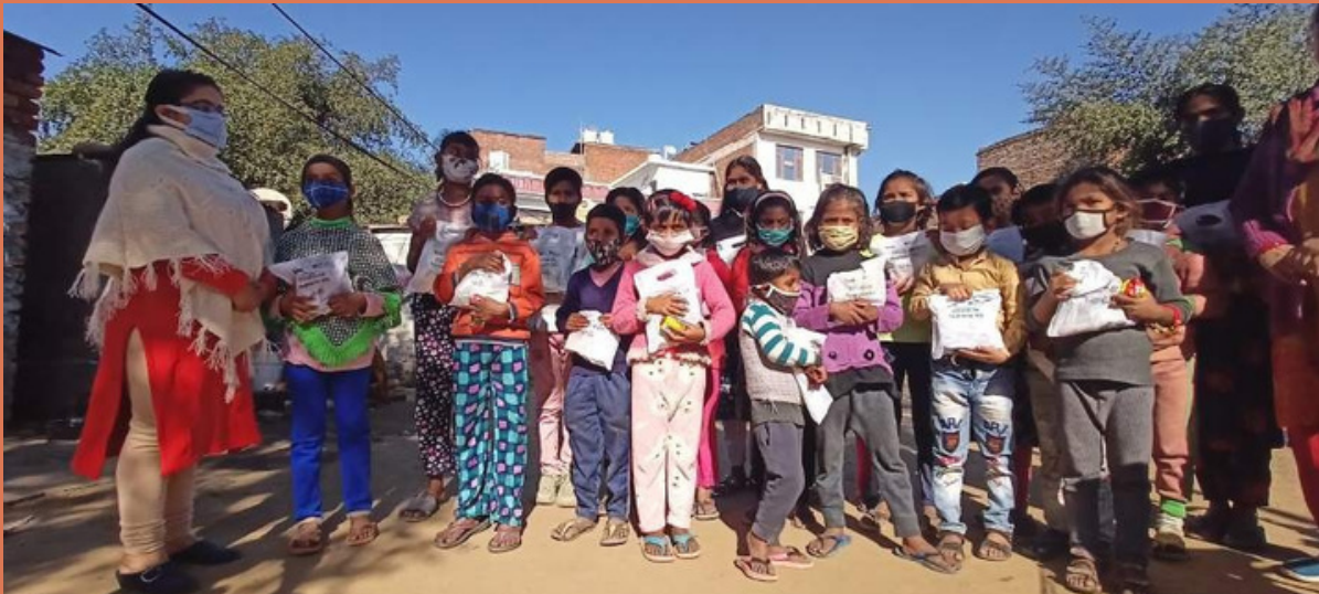
Hygiene kits have been distributed among the children of Sunrise Educational Trust.