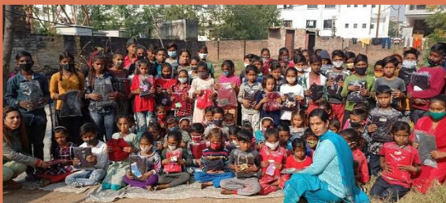
Sunrise Educational Trust distributed sweater to the underprivileged children.